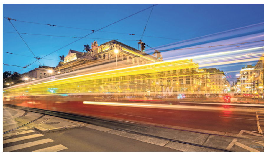
Fire up the economy: a tram speeds through Vienna, where business leaders call for swift changes to fiscal policy

Over the past six years, Europe's economies have faced their fair share of difficulties. But while many have stumbled, Austria has emerged from the storms remarkably well.